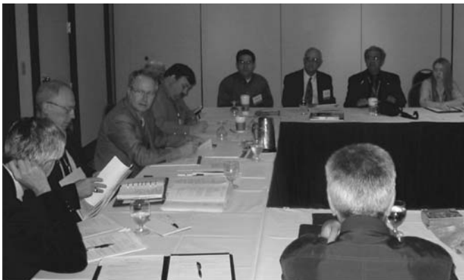
IEEE Education Society Business Meeting in Nashville, June 2003.

I also want to mention again the importance of your active participation in ASEE and IEEE activities. Soon I will send out a call for nominations through the ASEE listserv and ask you to