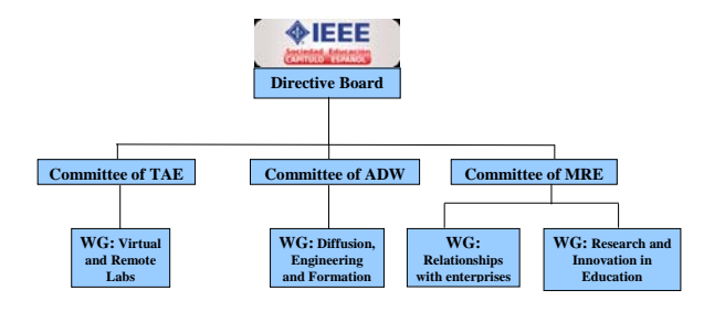
Figure 1. Structure of the Spanish Chapter of the Education Society of the IEEE (CESEI).

Since his creation in 2004, the CESEI has tried to be a meeting point for the responsible from the University as from the Enterprise that work for the improvement of the teaching of engineering and computing.