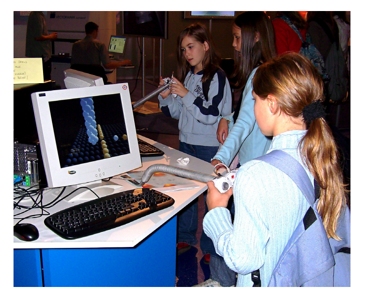
Figure 3. Youngsters making their first manipulation experiments at the nanoscale level. Three interconnected Nanojoystick stations were presented at the Sciencedays in Rust, Germany, attended by nearly 20.000 prospective students.

In the context of science communication events such as the Sciencedays in Germany [18], the Nanojoystick is an ideal demonstrator to invite scholars to get in touch with science (see Fig. 3). The use of several stations with competition through a global ranking is well suited to involve not only single, but small groups of visitors. The high-precision control of the tip via the joystick has been appealing to both girls and boys.