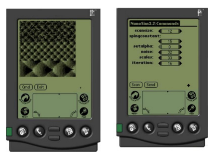
Figure 4. NanoMobile remote steering interface on a PDA. Left: View of an observed surface with atomic resolution. Right: List of gauges to view and adjust experiment parameters.

that she needs to take action. Human supervision is only necessary in case of malfunction, extraordinary events or termination of the experiment. The mobile client and a notification system allow students and researchers to supervise their experiment in the most time-efficient manner.