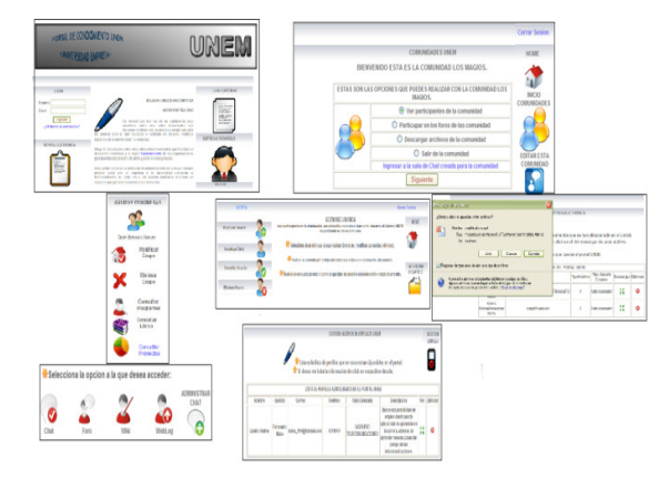
Figure 3 Project Results

Currently the portal is been proved. One company of the electrical sector is helping us to prove the portal; this company is working with the "Universidad Distrital Francisco Jose de Caldas", which is the University where we developed the project. There is a huge communication problem and with this project we are trying to solve it. However, it is a long process in which the portal is going to change according with the necessities.