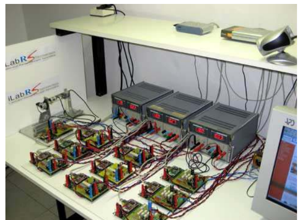
Figure 3. Remote laboratory current set of boards. It includes 10 main boards and 3 replica of 3 different experiment boards performing 12 different experiments on basic electronics plus a singular one (left) which measures the strain-stress characteristic of a polymer sample.

Once a given experiment is selected in the web page, the user gets the remote panel on his computer and takes the control of the LabView application (Vi, Virtual instrument) associated to this specific replica of the experiment. At the