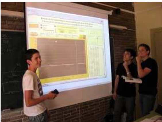
Figure 4. Students using the remote lab as demonstrator in the classroom in their High School

Seven High Schools from around Catalonia were selected and their Technology teachers were contacted. The amount of students of their Technology subjects in the two last years of High School was around 100. All of them were invited to visit the physical laboratory that supports the remote experiments in a specific Telecom BCN School Open Doors day. This was a good activity, useful not only to increase the feeling of reality of the remote lab but also to show the students the School laboratories and facilities and even the research activities. During the last term of year 2008, they performed classes based on the remote lab, mainly using two modalities: taking the whole group to the computer room and carrying out the experiences described in the didactic guides or using the experiments as demonstrators in the classroom using a projector (Figure 4).