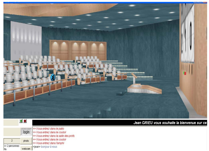
Figure 2. Amphitheatre with an avatar

In the lower part of the window, we can find on the left the numbers and the names of the connected people, several functions for login, for choosing a representative photo for the avatar, for a private chat between two users and a general map of the site. Under the blue scrolling banner announcing the last news, we can find a public chat available for all the users.