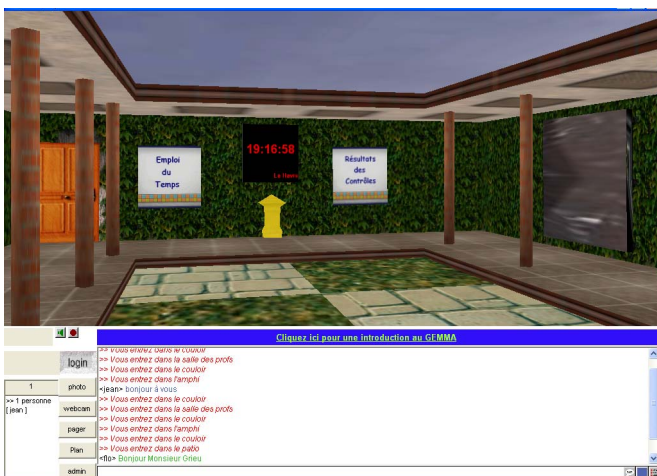
Figure 1. Entrance of the virtual campus 978-1-4244-6571-2/10/$26.00 ©2010 IEEE

In the first area (Fig. 1), we can find in the 3D part a mail box to send e-mail, a board for the time tables, a board for the assessment marks, a board for the system help, a clock to be on time, a door to access other areas.