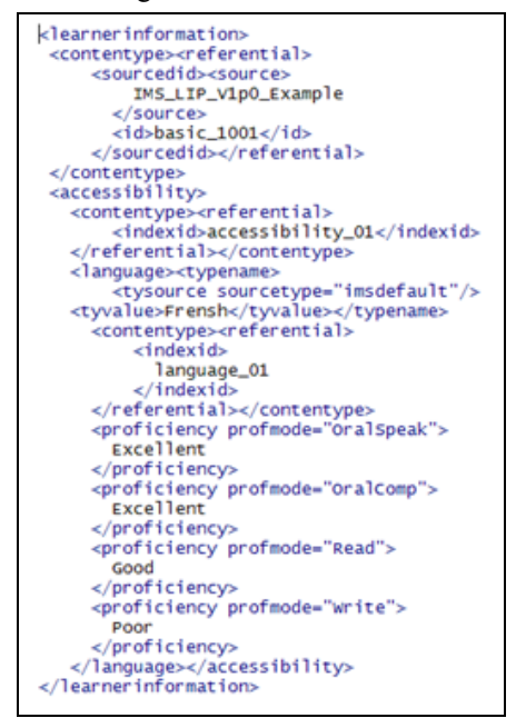
Figure 5. An example of LIP Accessibility information.

An example of accessibility category data is represented in Figure 5.